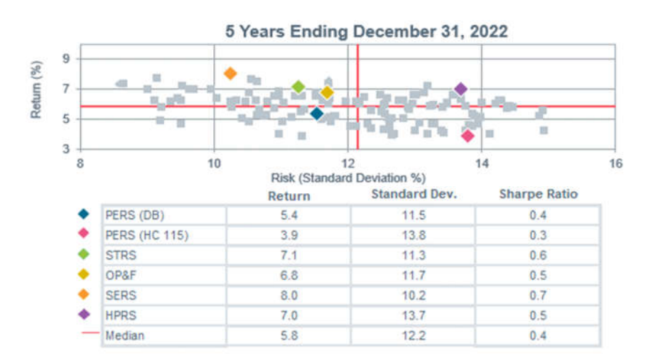
Figure 10: All Public Plans > $1B Risk and Return

While additional analysis is needed to fully understand the risk posture of each plan, the risk and return charts shown below suggest five of six plans have generated more return for each unit of risk exposure (as measured by standard deviation) than the median peer over the trailing 5-year period. Two plans have exhibited more asset risk (as defined by standard deviation) relative to peers over the trailing 10-year period (see Figure 10). Peers may have different risk/return results for a variety of reasons, including but not limited to: objectives and goals, target allocations, time of allocation changes, investment restrictions, asset class exposures, or investment management execution.