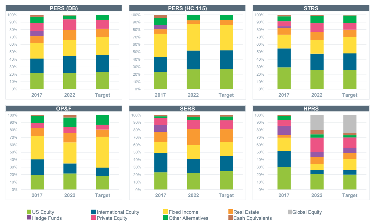
Figure 2: Asset Allocation Changes (5 Years)

PERS (HC 115) currently has the largest allocation to US equity at 26.6%. Two of the six plans have a higher exposure to US equities than peer median (peer median: 25.4%). PERS (HC 115) has the largest fixed income allocation at 35.7%. The average total allocation to hedge funds, private equity, and other alternatives among the six plans is 19.4%. Relative to peer median allocations (All Public Plans > $1B), four of six plans have higher strategic exposures to international equities (peer median: 15.3%) Four of six plans have higher allocations to real estate than peer median (peer median: 9.0%).