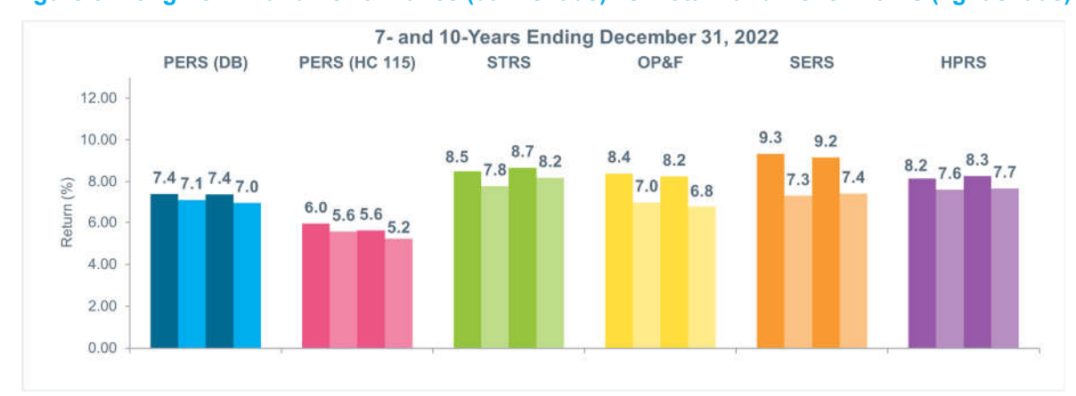
Figure 8: Long-Term Fund Performance (dark shade) vs. Total Fund Benchmarks (light shade)

Longer-term performance remains strong as all six plans have outperformed or kept pace with their custom benchmark over the trailing 7- and 10-year periods (see Figure 8).