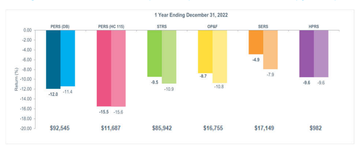
Figure 1: Total Fund Performance (dark shade) vs. Total Fund Benchmarks (light shade)

The dispersion in results among the State's retirement plans is driven by differences in asset allocation, asset class structure and investment manager selection, though it is not possible with the data available to RVK for us to weight each factor. During 2022, five out of six plans outperformed or kept pace with their custom total fund benchmarks. Each plan will have different investment objectives and goals and the "Total Fund Benchmarks" will reflect this. Total Fund over/under performance can come from differences in actual allocations or investment manager results.