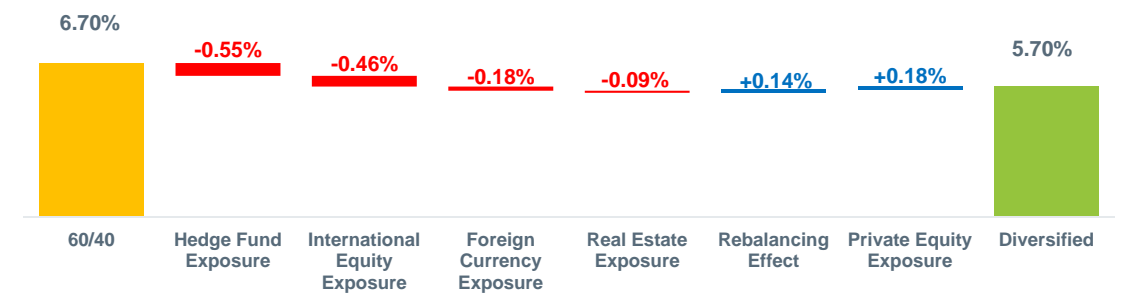
Figure 1: Comparative Performance of Diversified Portfolio vs. US 60/40 Portfolio (July 1, 2007 – June 30, 2017)

Sources: RVK, Inc., Morningstar, Bloomberg (2017)