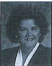
Betty Montgomery Attorney General