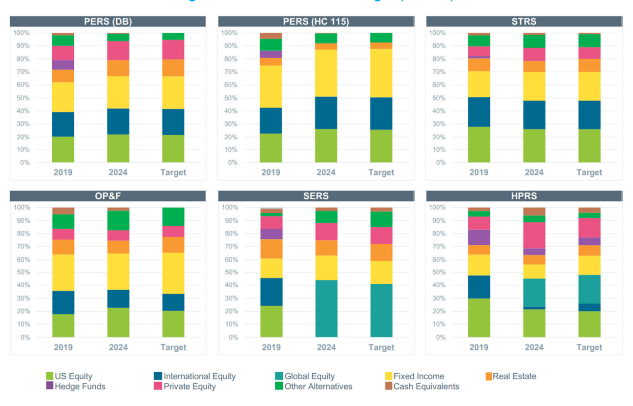
Figure 2: Asset Allocation Changes (5 Years)

PERS (HC 115) currently has the largest allocation to US equity at 26.2%. Zero of the six plans have a higher exposure to US equities than peer median (peer median: 28.2%). PERS (HC 115) has the largest fixed income allocation at 36.1%. The average total allocation to hedge funds, private equity, and other alternatives among the six plans is 19.5%. Relative to peer median allocations (All Public Plans > $1B), four of six plans have higher strategic exposures to international equities (peer median: 15.7%) Four of six plans have higher allocations to real estate than peer median (peer median: 7.3%).