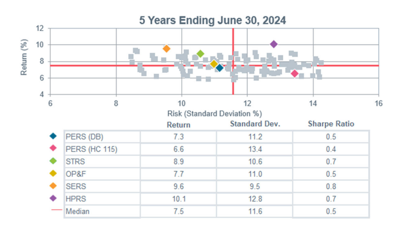
Figure 10: All Public Plans > $1B Risk and Return

While additional analysis is needed to fully understand the risk posture of each plan, the risk and return charts shown below suggest four of six plans have generated more return for each unit of risk exposure (as measured by standard deviation) than the median peer over the trailing 5-year period. Two plans have exhibited more asset risk (as defined by standard deviation) relative to peers over the trailing 10-year period (see Figure 10). Peers may have different risk/return results for a variety of reasons, including but not limited to: objectives and goals, target allocations, time of allocation changes, investment restrictions, asset class exposures, or investment management execution.