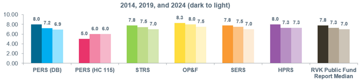
Figure 6: Historical Actuarial Rates of Return

Over the past ten years, the median actuarial rate of return for public funds within the RVK universe has declined (see Figure 6). Actuarial rates for four of the six Ohio plans are above the RVK universe median. Figure 7 shows the dispersion of actuarial rates of return around the median of 7.0%.