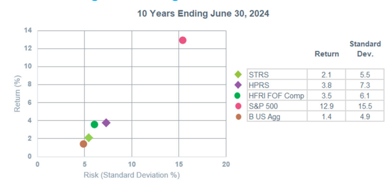
Figure 16: Hedge Funds Performance

Composite returns during the 10-year trailing period range from 2.1% to 3.8% among the two plans with dedicated hedge fund composites. Over the trailing 10-year period one out of two hedge fund allocations equaled or outperformed their respective benchmarks.