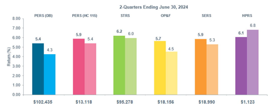
Figure 1: Total Fund Performance (dark shade) vs. Total Fund Benchmarks (light shade)

During the first half of 2024, five out of six plans outperformed or kept pace with their custom total fund benchmarks. Each plan will have different investment objectives and goals and the "Total Fund Benchmarks" will reflect this. Total Fund over/under performance can come from differences in actual allocations or investment manager results.